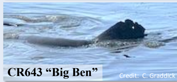
CR643 “Big Ben”