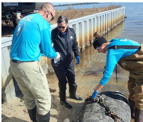
MSN responds to deceased manatee

During January, MSN responded to a suspected cold stress related manatee mortality along Perdido Bay in Baldwin County, AL. The carcass was recovered, transported to the DISL Marine Mammal Research Center, and frozen pending necropsy when resources are available. Our team plans to conduct a necropsy this summer as part of an undergraduate Marine Mammal Health course taught by the MSN veterinarian.