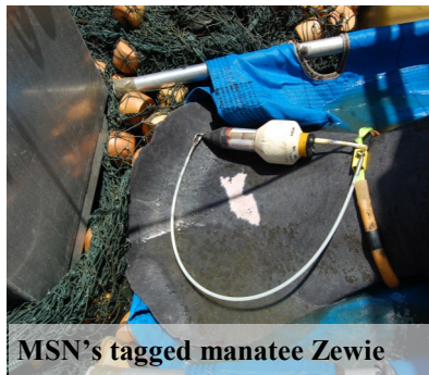
MSN's tagged manatee Zewie