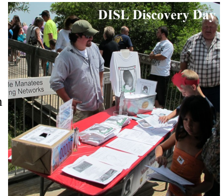
DISL Discovery Day

MSN volunteers & personnel have been busy attending local events, including DISL's Discovery Day open house and the DISL Foundation fundraiser, Cocktails With Critters held at Tacky Jack's on the causeway. Want to find us on the road? Visit our booth at the Dauphin Island Fishing Rodeo, July 9, 15-17.